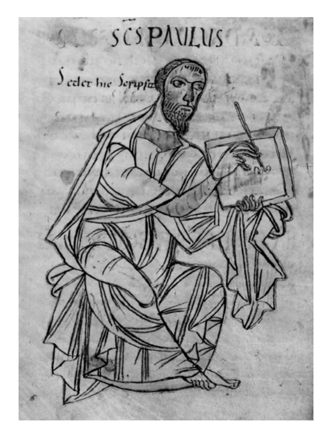
Stüttgart, Württembergische Landesbibliothek, HB II 54, f. 25v.

The COMPAUL project has received funding from the the European Union Seventh Framework Programme (FP7/2007–2013) under grant agreement no. 283302 ("The Earliest Commentaries on Paul as Sources for the Biblical Text").